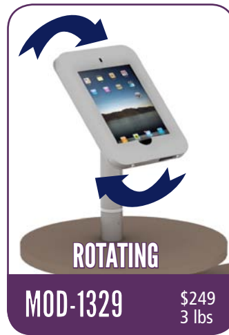
MOD-1329 $249 3 lbs